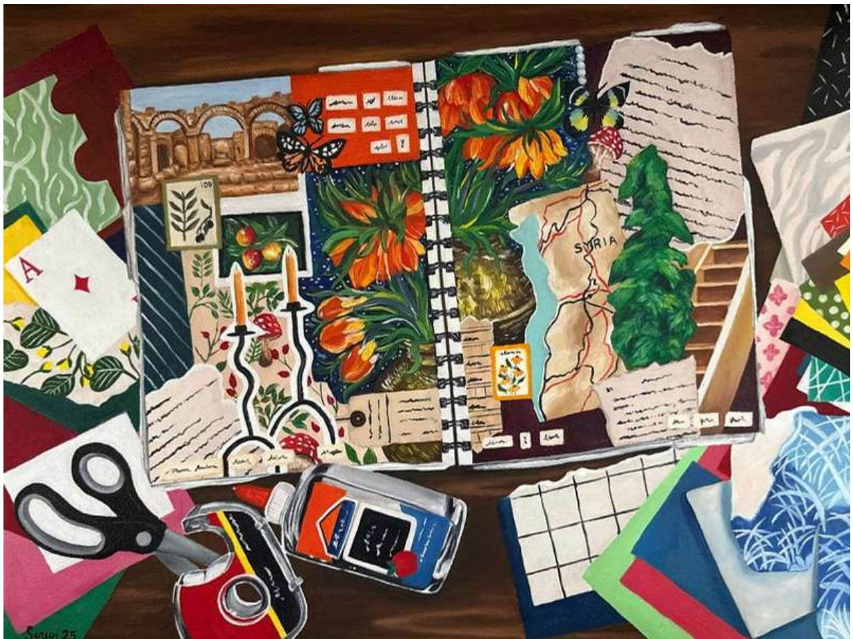
Junk Journal, 12 x 16 inches, oil on canvas