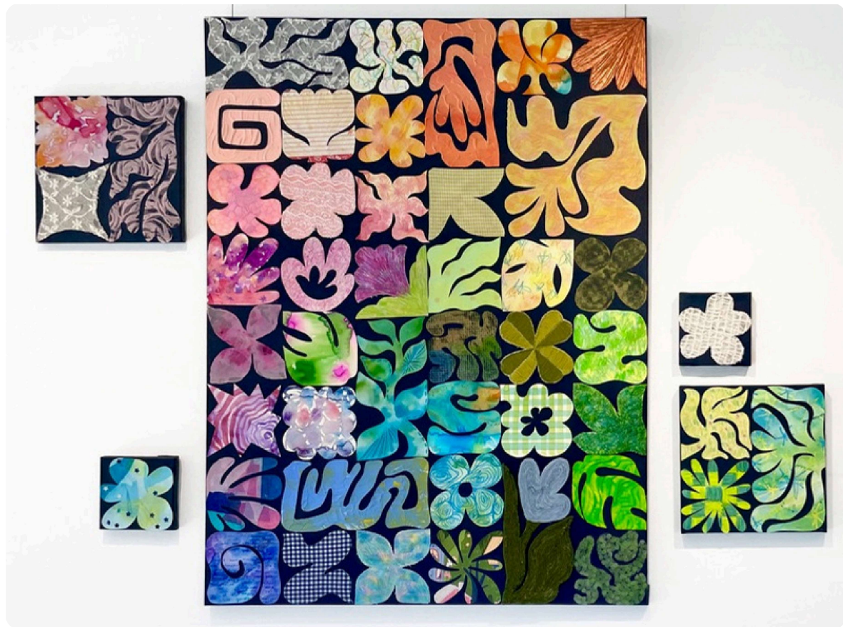
Taking Form, 40 x 50 inches, mixed materials on canvas