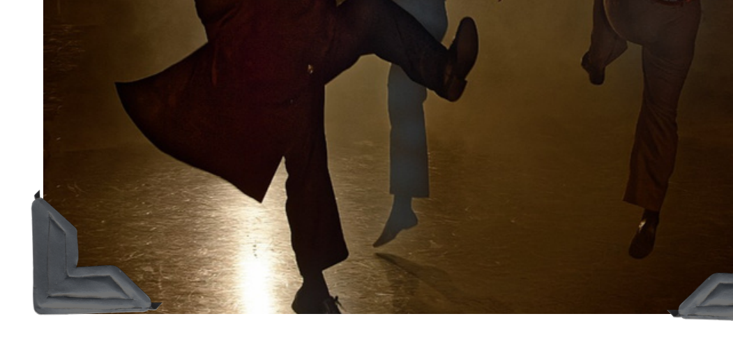
BOLLYWOOD MONSTER MASHUP