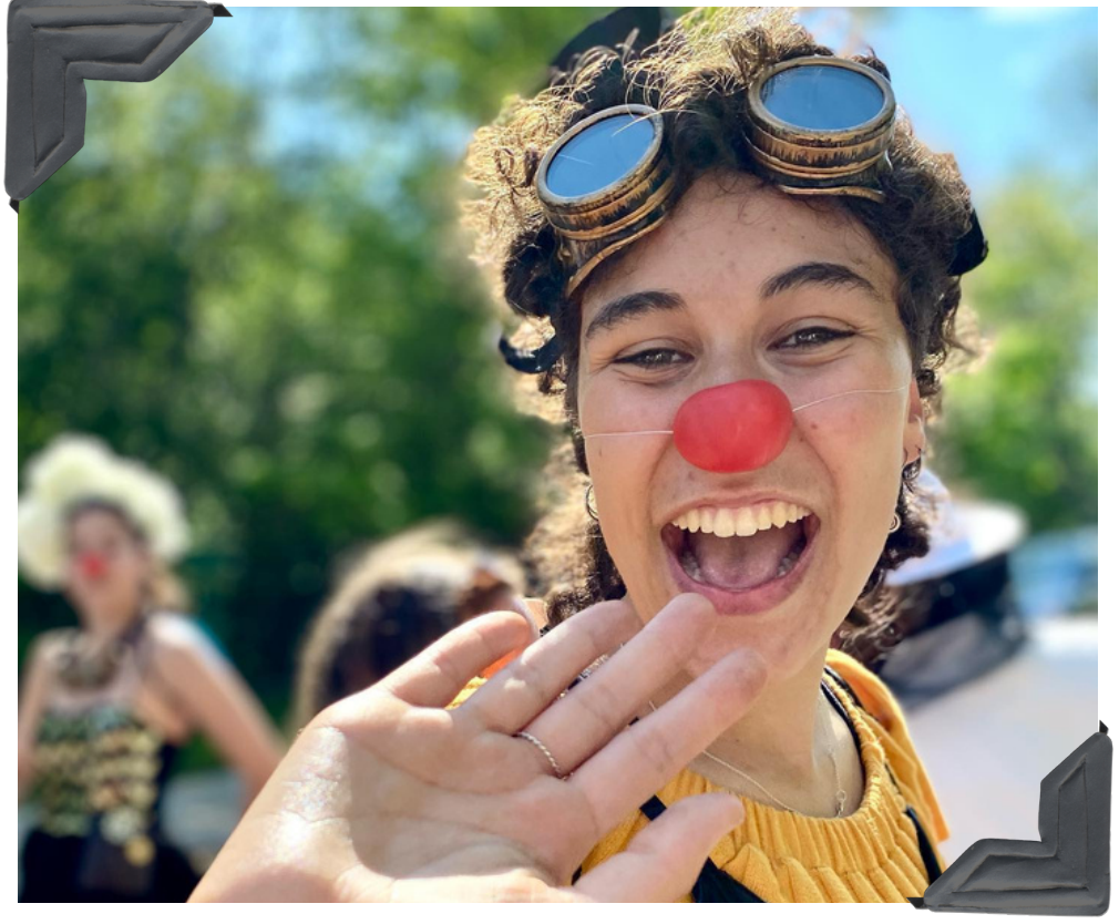
BEEKEEPERS @ BREAD & HONEY FESTIVAL