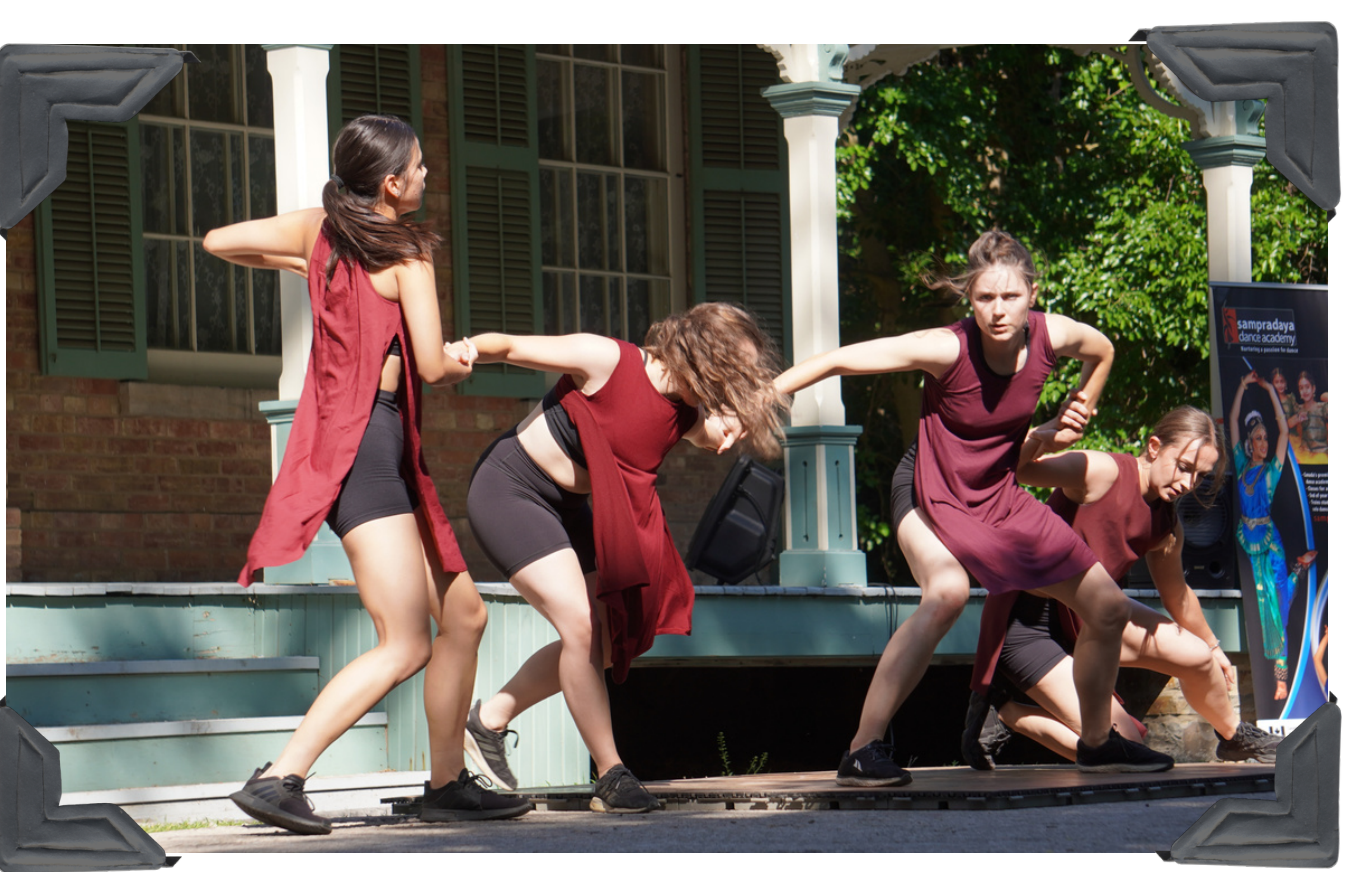
SAMPRADAYA DANCE SUMMER SKIES FESTIVAL